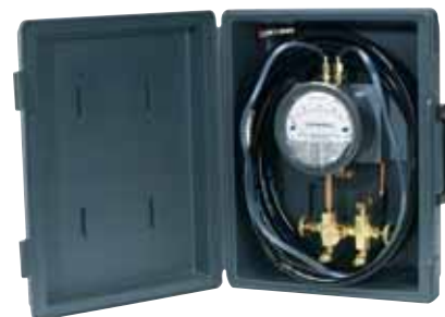
CAPSUHELIC® GAGE SHOWN INSTALLED IN A-471 PORTABLE KIT

For portable operation, the A-471 Capsuhelic® Portable Gage Kit is available complete with tough polypropylene carrying case, mounting bracket, 3-way manifold valve, two 10' high pressure hoses, and all necessary fittings. See pages 8 and 9 for complete information on the Capsuhelic® gage.